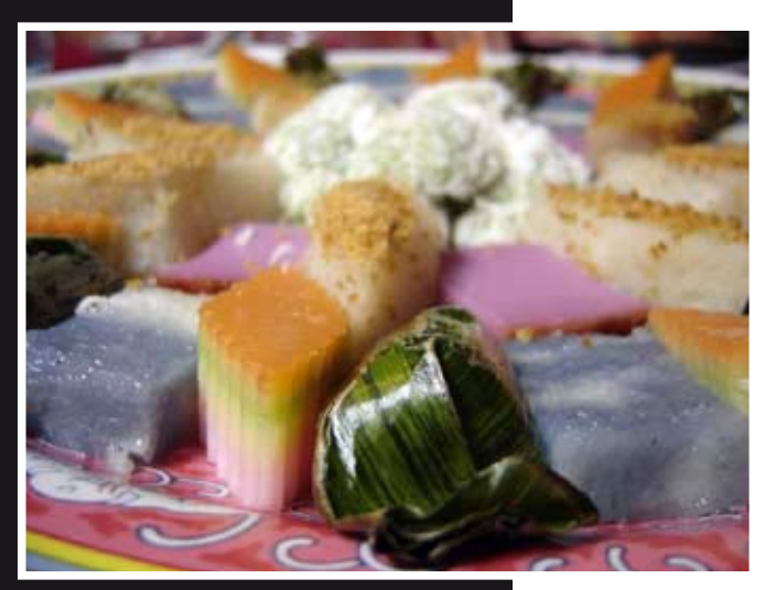
Nyonya Sweets