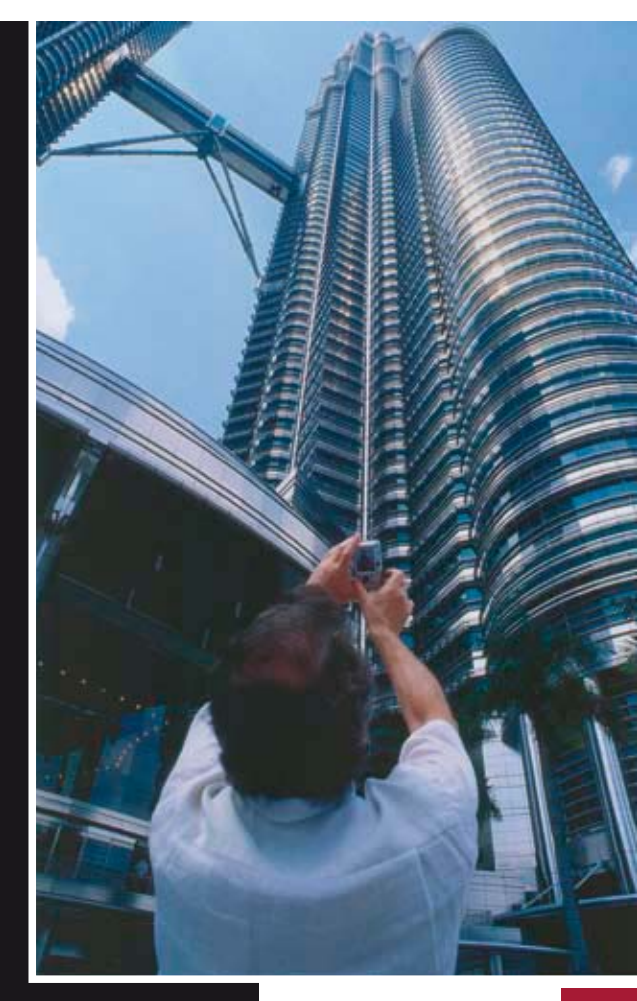
KL – Petronas