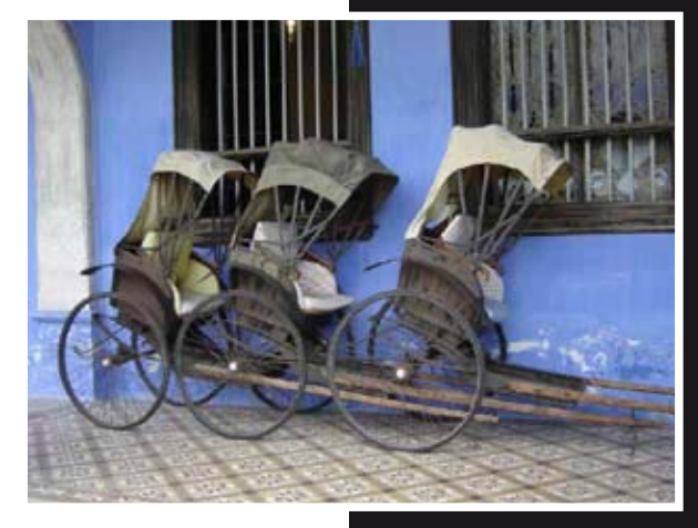
Carritos Blue Mansion