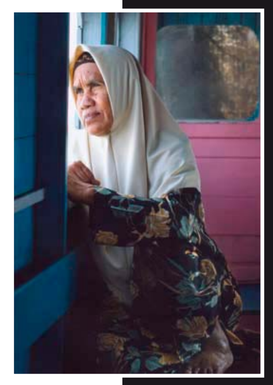
Old lady