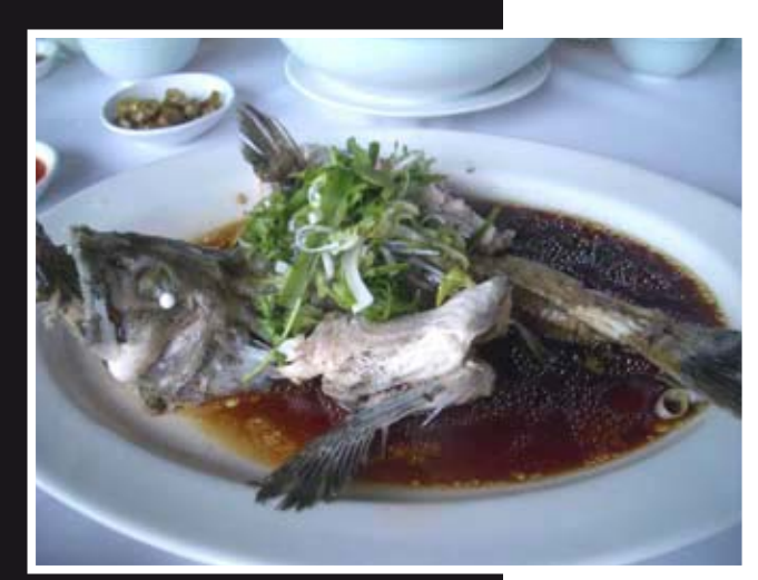
Fish Kuala Lumpur