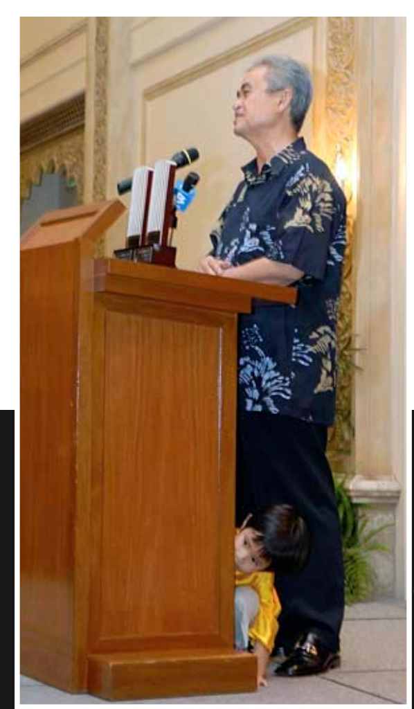
Prime Minister and kid