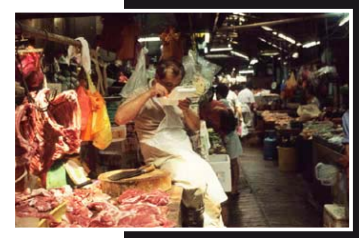
Man eating